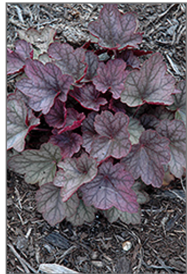
Carnival Rose Granita Coral Bells foliage

Carnival Rose Granita Coral Bells is recommended for the following landscape applications;