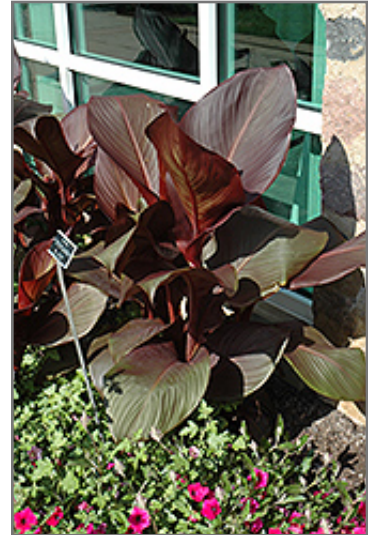
Tropicanna Black Canna

This plant is native to the tropics and prefers growing in moist environments with evenly warm conditions all year round. In our climate, it is usually grown as an outdoor annual in the garden or in a container. If you want it to survive the winter, it can be brought in to the house and provided with special care, and then returned to the garden the following season. In its preferred tropical habitat, it can grow to be around 5 feet tall at maturity, with a spread of 24 inches. However, when grown as an annual or when overwintered indoors, it can be expected to perform differently, and its exact height and spread will depend on many factors; you may wish to consult with our experts as to how it might perform in your specific application and growing conditions.