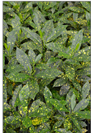
Gold Dust Variegated Croton foliage