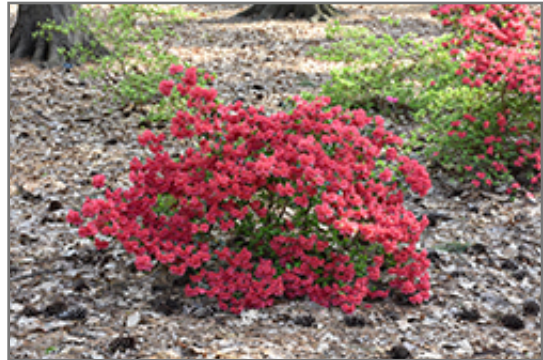
Girard's Crimson Azalea in bloom