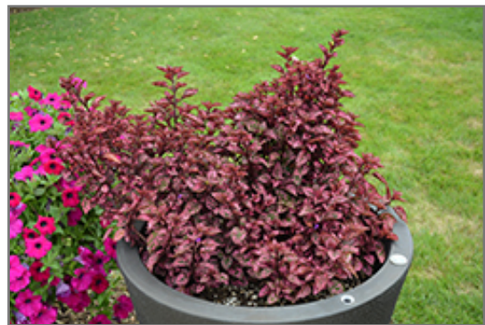
Hippo Rose Polka Dot Plant