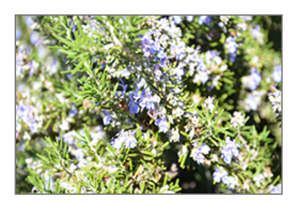
Blue Spires Rosemary flowers