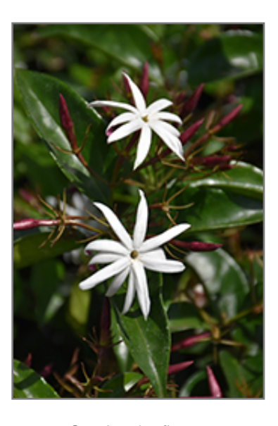
Star Jasmine flowers