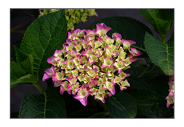
Seaside Serenade Cape Cod Hydrangea flowers