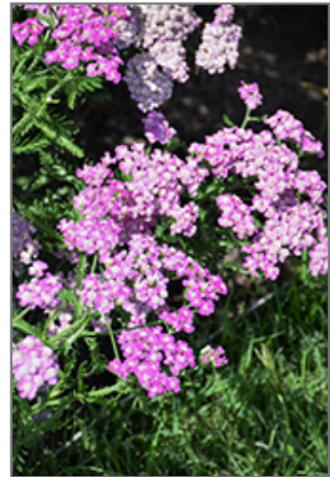
Firefly Amethyst Yarrow flowers

Firefly Amethyst Yarrow is recommended for the following landscape applications;