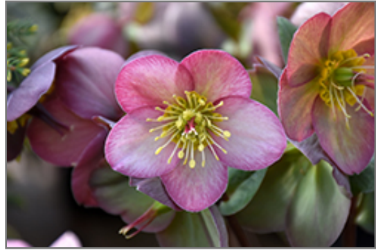
FrostKiss Cheryl's Shine Hellebore flowers

This is a relatively low maintenance plant, and should be cut back in late fall in preparation for winter. Deer don't particularly care for this plant and will usually leave it alone in favor of tastier treats. It has no significant negative characteristics.