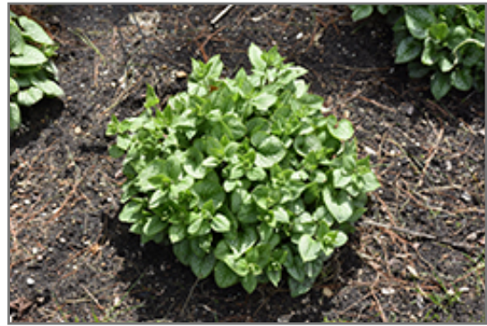
Jack of Diamonds Bugloss

Jack of Diamonds Bugloss will grow to be about 14 inches tall at maturity, with a spread of 30 inches. When grown in masses or used as a bedding plant, individual plants should be spaced approximately 28 inches apart. It grows at a medium rate, and under ideal conditions can be expected to live for approximately 10 years. As an herbaceous perennial, this plant will usually die back to the crown each winter, and will regrow from the base each spring. Be careful not to disturb the crown in late winter when it may not be readily seen!