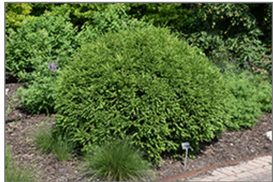
Green Gem Boxwood