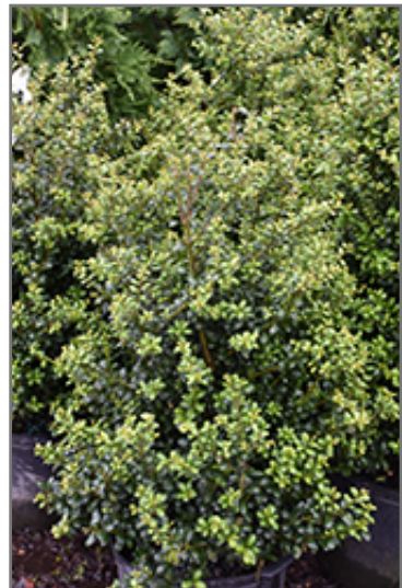
Chesapeake Japanese Holly