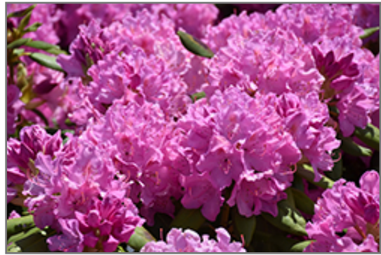
Roseum Elegans Rhododendron flowers