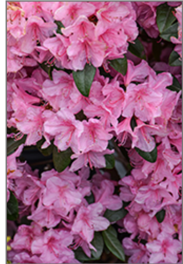
Aglo Rhododendron flowers