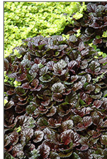
Black Scallop Bugleweed