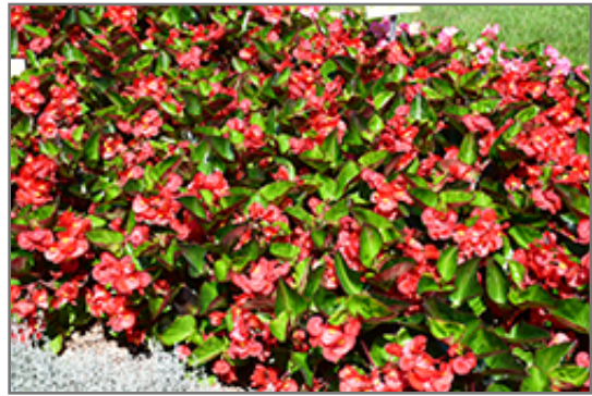
Big Red Green Leaf Begonia in bloom

Big Red Green Leaf Begonia is a fine choice for the garden, but it is also a good selection for planting in outdoor containers and hanging baskets. It is often used as a 'filler' in the 'spiller-thriller-filler' container combination, providing a mass of flowers and foliage against which the larger thriller plants stand out. Note that when growing plants in outdoor containers and baskets, they may require more frequent waterings than they would in the yard or garden.