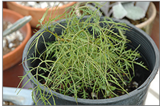
Whirlwind Goatsbeard foliage