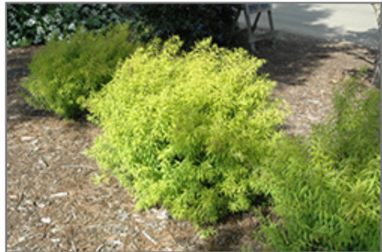
Mellow Yellow Spirea

Mellow Yellow Spirea is recommended for the following landscape applications;