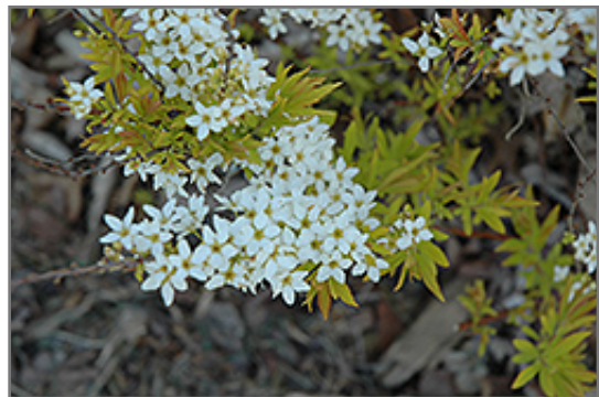
Mellow Yellow Spirea flowers