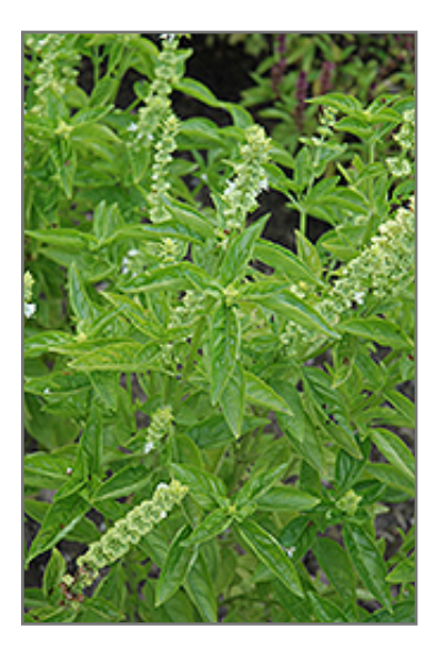
Sweet Italian Basil flowers

This plant is quite ornamental as well as edible, and is as much at home in a landscape or flower garden as it is in a designated herb garden. It should only be grown in full sunlight. It prefers to grow in average to moist conditions, and shouldn't be allowed to dry out. It is not particular as to soil type or pH. It is somewhat tolerant of urban pollution. This is a selected variety of a species not originally from North America. It can be propagated by cuttings; however, as a cultivated variety, be aware that it may be subject to certain restrictions or prohibitions on propagation.