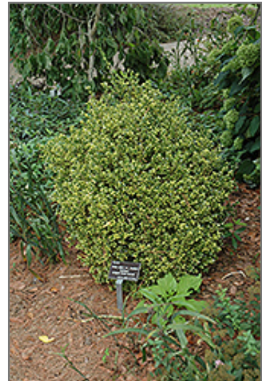
Sunburst Variegated Korean Boxwood