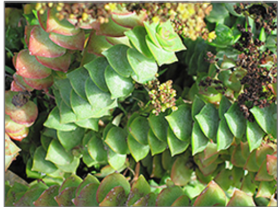
String Of Buttons foliage

String Of Buttons is recommended for the following landscape applications;