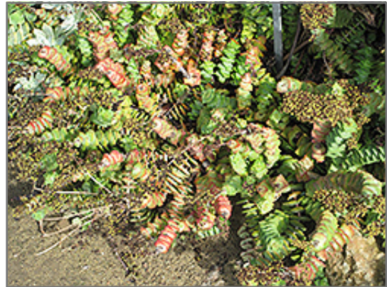
String Of Buttons

String Of Buttons is recommended for the following landscape applications;