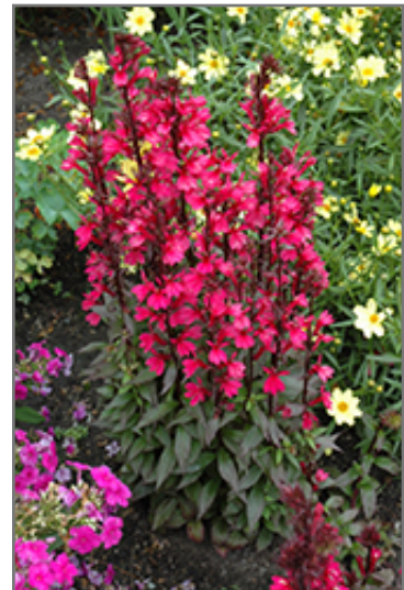
Starship Deep Rose Lobelia in bloom