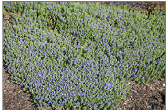
Tidal Pool Speedwell in bloom