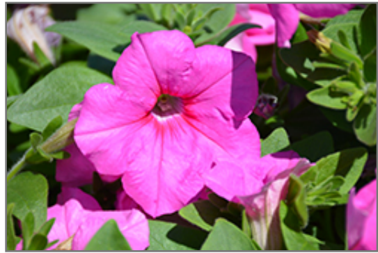
Easy Wave Pink Passion Petunia flowers

Easy Wave Pink Passion Petunia is recommended for the following landscape applications;