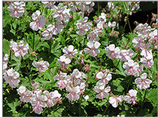
Biokovo Cranesbill in bloom

Biokovo Cranesbill is a fine choice for the garden, but it is also a good selection for planting in outdoor pots and containers. Because of its spreading habit of growth, it is ideally suited for use as a 'spiller' in the 'spiller-thriller-filler' container combination; plant it near the edges where it can spill gracefully over the pot. Note that when growing plants in outdoor containers and baskets, they may require more frequent waterings than they would in the yard or garden.