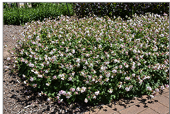
Biokovo Cranesbill in bloom