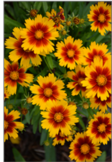
UpTick Gold and Bronze Tickseed flowers

UpTick Gold and Bronze Tickseed is recommended for the following landscape applications;