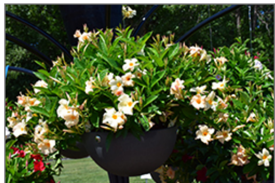
Sun Parasol Apricot Mandevilla in bloom