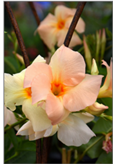
Sun Parasol Apricot Mandevilla flowers

This plant is native to the tropics and prefers growing in moist environments with evenly warm conditions all year round. In our climate, it is usually grown as an outdoor annual in the garden or in a container. If you want it to survive the winter, it can be brought in to the house and provided with special care, and then returned to the garden the following season. In its preferred tropical habitat, it can grow to be around 8 feet tall at maturity, with a spread of 24 inches. However, when grown as an annual or when overwintered indoors, it can be expected to perform differently, and its exact height and spread will depend on many factors; you may wish to consult with our experts as to how it might perform in your specific application and growing conditions.