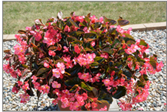
Megawatt Pink Bronze Leaf Begonia in bloom