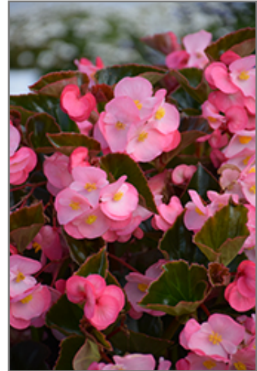
Megawatt Pink Bronze Leaf Begonia flowers

Megawatt Pink Bronze Leaf Begonia is an herbaceous annual with an upright spreading habit of growth. Its medium texture blends into the garden, but can always be balanced by a couple of finer or coarser plants for an effective composition.