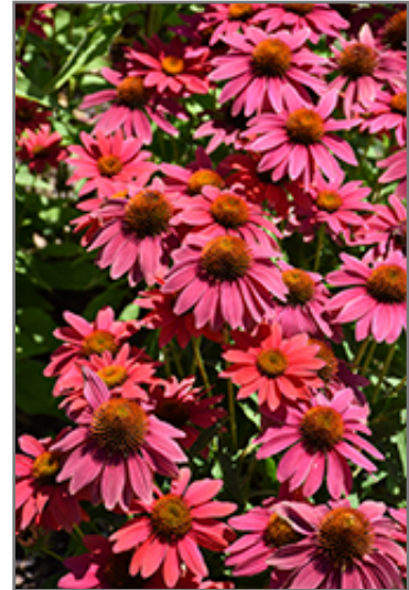
Sombrero Tres Amigos Coneflower flowers

This is a relatively low maintenance plant, and is best cleaned up in early spring before it resumes active growth for the season. It is a good choice for attracting butterflies to your yard, but is not particularly attractive to deer who tend to leave it alone in favor of tastier treats. It has no significant negative characteristics.