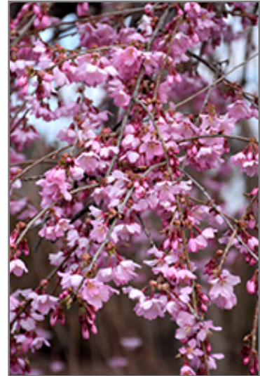
Pink Cascade Weeping Cherry flowers