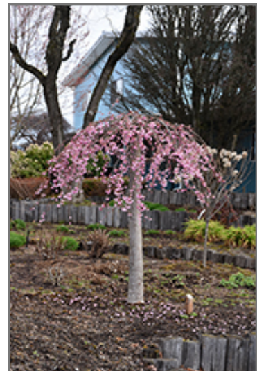
Pink Cascade Weeping Cherry in bloom