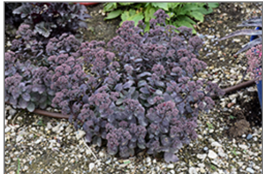
Rock 'N Grow Superstar Stonecrop in bloom