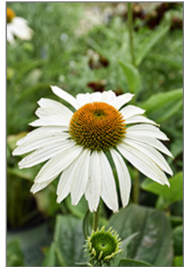
Happy Star Coneflower flowers