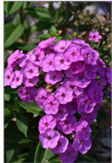
Ka-Pow Lavender Garden Phlox flowers

Ka-Pow Lavender Garden Phlox is recommended for the following landscape applications;