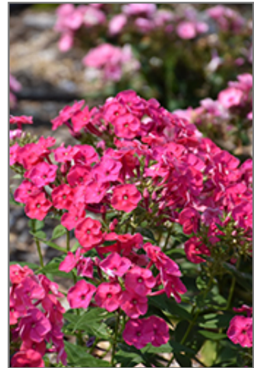
Ka-Pow Pink Garden Phlox flowers

Ka-Pow Pink Garden Phlox is recommended for the following landscape applications;