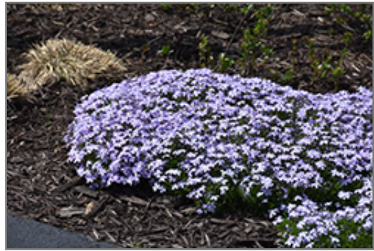
Spring Blue Moss Phlox in bloom