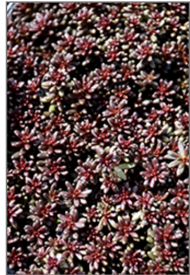
Coral Carpet Stonecrop

Coral Carpet Stonecrop is a fine choice for the garden, but it is also a good selection for planting in outdoor pots and containers. Because of its spreading habit of growth, it is ideally suited for use as a 'spiller' in the 'spiller-thriller-filler' container combination; plant it near the edges where it can spill gracefully over the pot. Note that when growing plants in outdoor containers and baskets, they may require more frequent waterings than they would in the yard or garden.