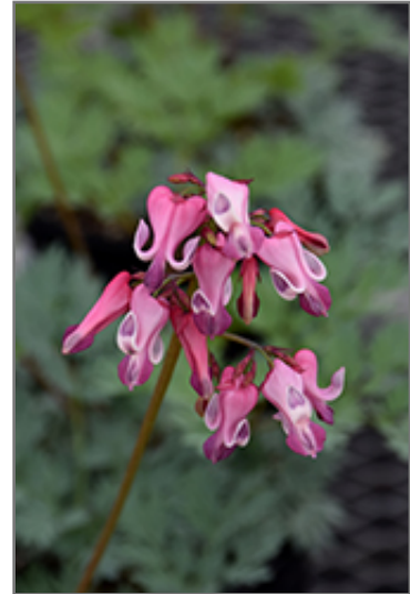
Pink Diamonds Fern-leaved Bleeding Heart flowers

Pink Diamonds Fern-leaved Bleeding Heart is a fine choice for the garden, but it is also a good selection for planting in outdoor pots and containers. It is often used as a 'filler' in the 'spiller-thriller-filler' container combination, providing a mass of flowers and foliage against which the thriller plants stand out. Note that when growing plants in outdoor containers and baskets, they may require more frequent waterings than they would in the yard or garden.