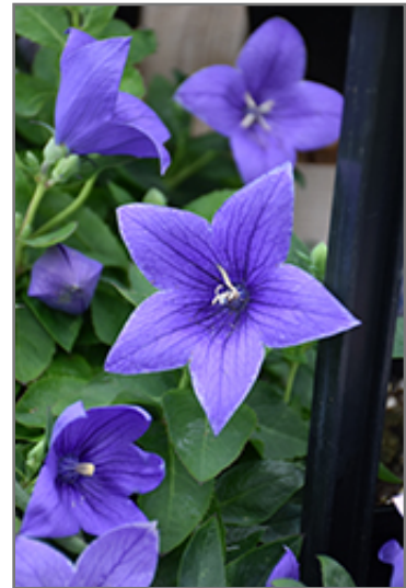
Pop Star Blue Balloon Flower flowers

Pop Star Blue Balloon Flower is recommended for the following landscape applications;