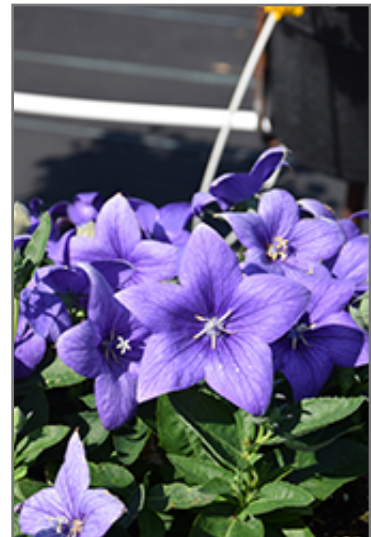
Pop Star Blue Balloon Flower flowers