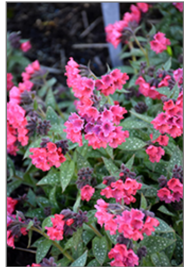
Shrimps On The Barbie Lungwort flowers

This is a relatively low maintenance plant, and should be cut back in late fall in preparation for winter. It is a good choice for attracting bees, butterflies and hummingbirds to your yard, but is not particularly attractive to deer who tend to leave it alone in favor of tastier treats. It has no significant negative characteristics.