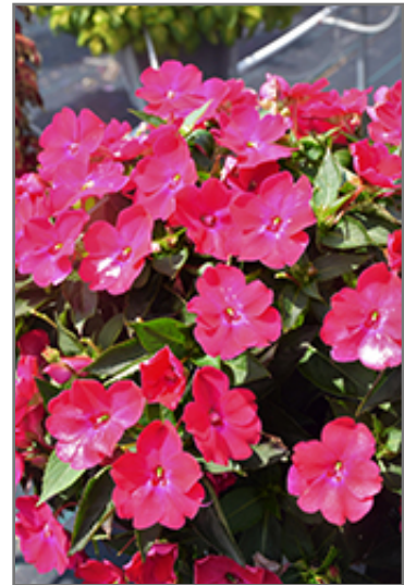
SunPatiens Compact Rose Glow New Guinea Impatiens flowers

SunPatiens Compact Rose Glow New Guinea Impatiens is a fine choice for the garden, but it is also a good selection for planting in outdoor containers and hanging baskets. It can be used either as 'filler' or as a 'thriller' in the 'spiller-thriller-filler' container combination, depending on the height and form of the other plants used in the container planting. It is even sizeable enough that it can be grown alone in a suitable container. Note that when growing plants in outdoor containers and baskets, they may require more frequent waterings than they would in the yard or garden.