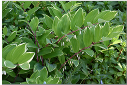
Variegated Solomon's Seal flowers