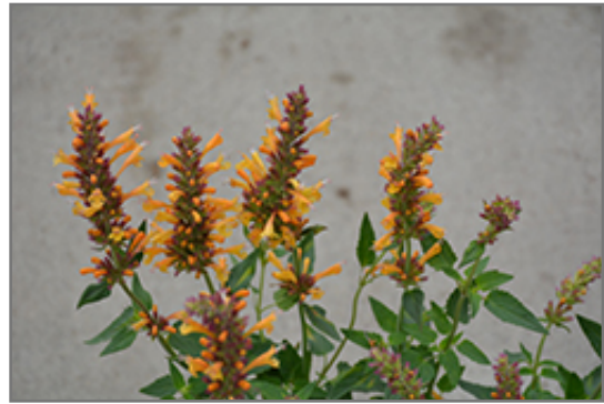
Kudos Gold Hyssop flowers