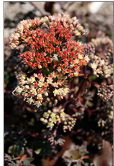
Peach Pearls Stonecrop flowers

Peach Pearls Stonecrop is a fine choice for the garden, but it is also a good selection for planting in outdoor pots and containers. With its upright habit of growth, it is best suited for use as a 'thriller' in the 'spiller-thriller-filler' container combination; plant it near the center of the pot, surrounded by smaller plants and those that spill over the edges. Note that when growing plants in outdoor containers and baskets, they may require more frequent waterings than they would in the yard or garden.