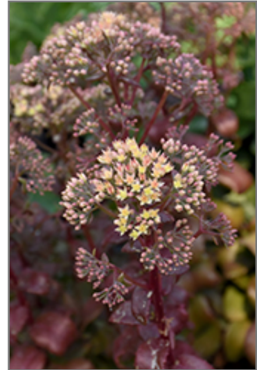
Peach Pearls Stonecrop flowers

Peach Pearls Stonecrop is recommended for the following landscape applications;