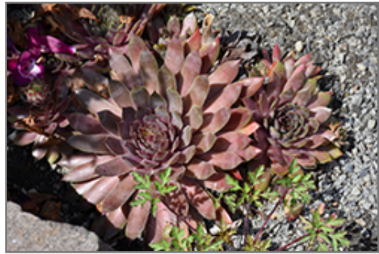
Kalinda Hens And Chicks

Kalinda Hens And Chicks is recommended for the following landscape applications;