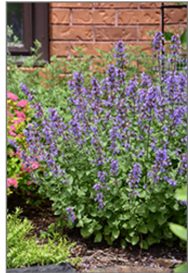
Picture Purrfect Catmint flowers

Picture Purrfect Catmint is a dense herbaceous perennial with a mounded form. Its relatively fine texture sets it apart from other garden plants with less refined foliage.