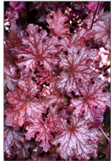
Ruby Tuesday Coral Bells foliage

Ruby Tuesday Coral Bells will grow to be about 9 inches tall at maturity extending to 16 inches tall with the flowers, with a spread of 14 inches. When grown in masses or used as a bedding plant, individual plants should be spaced approximately 12 inches apart. Its foliage tends to remain low and dense right to the ground. It grows at a medium rate, and under ideal conditions can be expected to live for approximately 10 years. As an evergreen perennial, this plant will typically keep its form and foliage year-round.