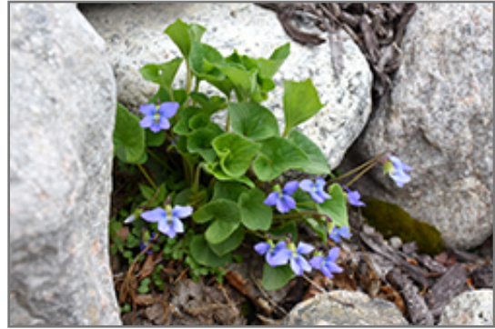
Woolly Blue Violet in bloom

Woolly Blue Violet will grow to be only 4 inches tall at maturity extending to 6 inches tall with the flowers, with a spread of 6 inches. When grown in masses or used as a bedding plant, individual plants should be spaced approximately 5 inches apart. Its foliage tends to remain low and dense right to the ground. It grows at a fast rate, and under ideal conditions can be expected to live for approximately 3 years. As an herbaceous perennial, this plant will usually die back to the crown each winter, and will regrow from the base each spring. Be careful not to disturb the crown in late winter when it may not be readily seen!