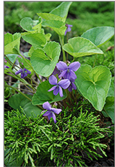
Woolly Blue Violet flowers

Woolly Blue Violet is recommended for the following landscape applications;