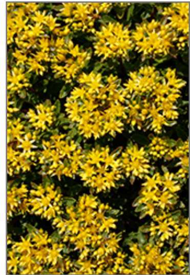
Rock 'N Round Bright Idea Stonecrop flowers

This is a relatively low maintenance plant, and is best cleaned up in early spring before it resumes active growth for the season. It is a good choice for attracting bees and butterflies to your yard, but is not particularly attractive to deer who tend to leave it alone in favor of tastier treats. It has no significant negative characteristics.