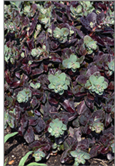
Night Light Stonecrop foliage

Night Light Stonecrop is a dense herbaceous perennial with an upright spreading habit of growth. Its relatively coarse texture can be used to stand it apart from other garden plants with finer foliage.