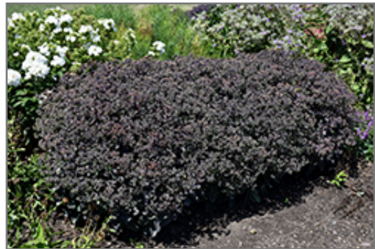
Night Light Stonecrop in bloom